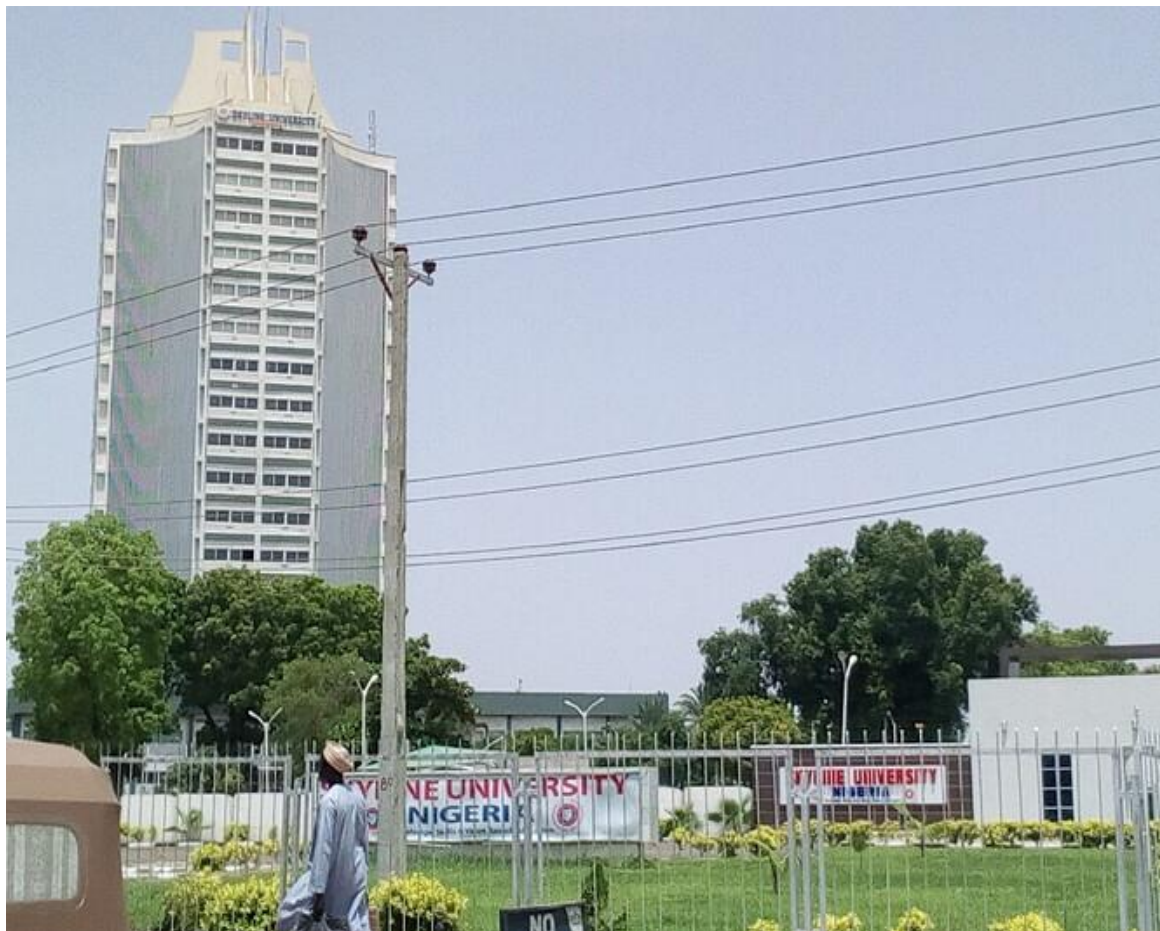
Figure 6: Skyline University (LGC, 2021)