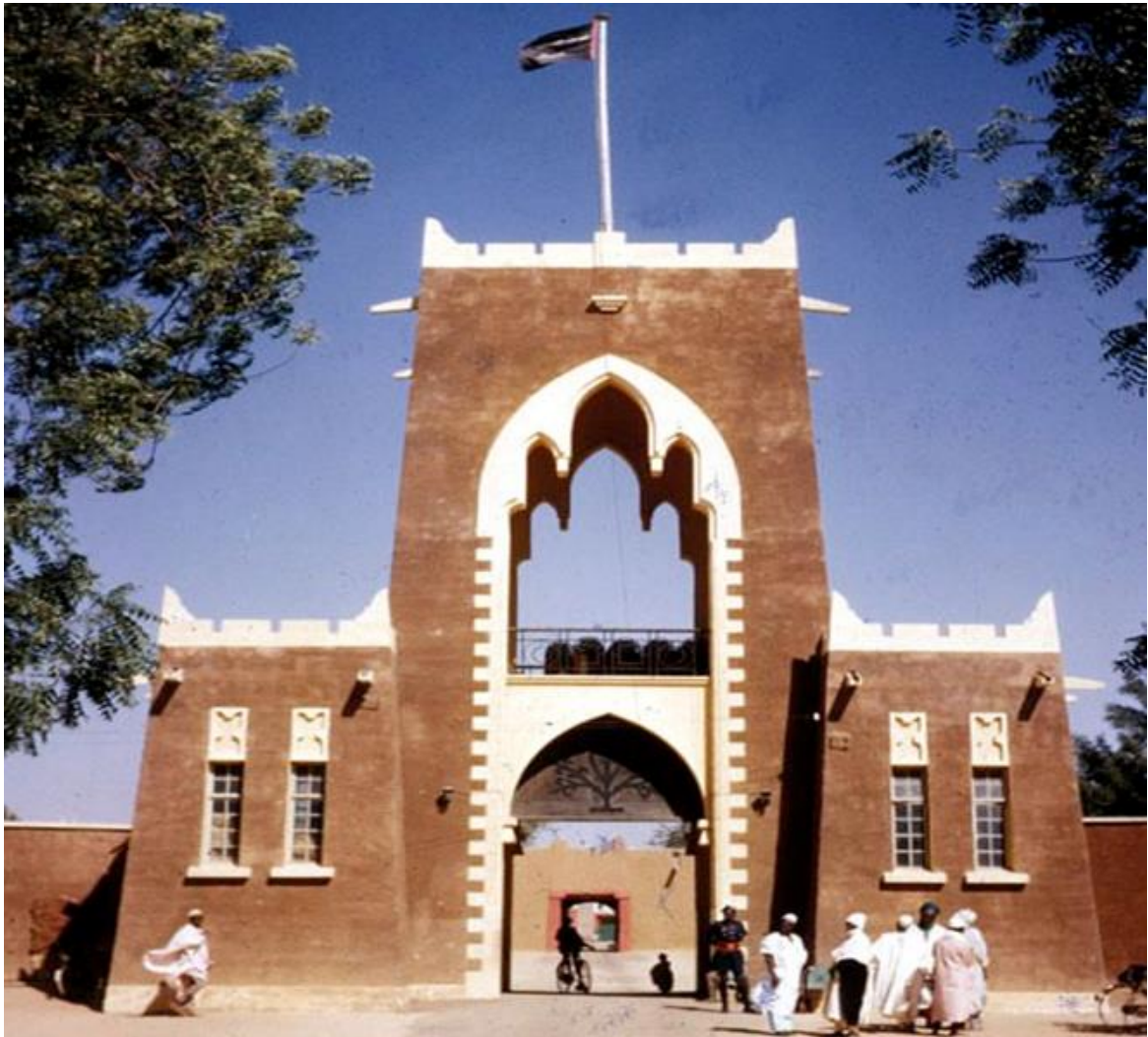
Figure 3: Gidan Rumfa (Archnet, 2020)