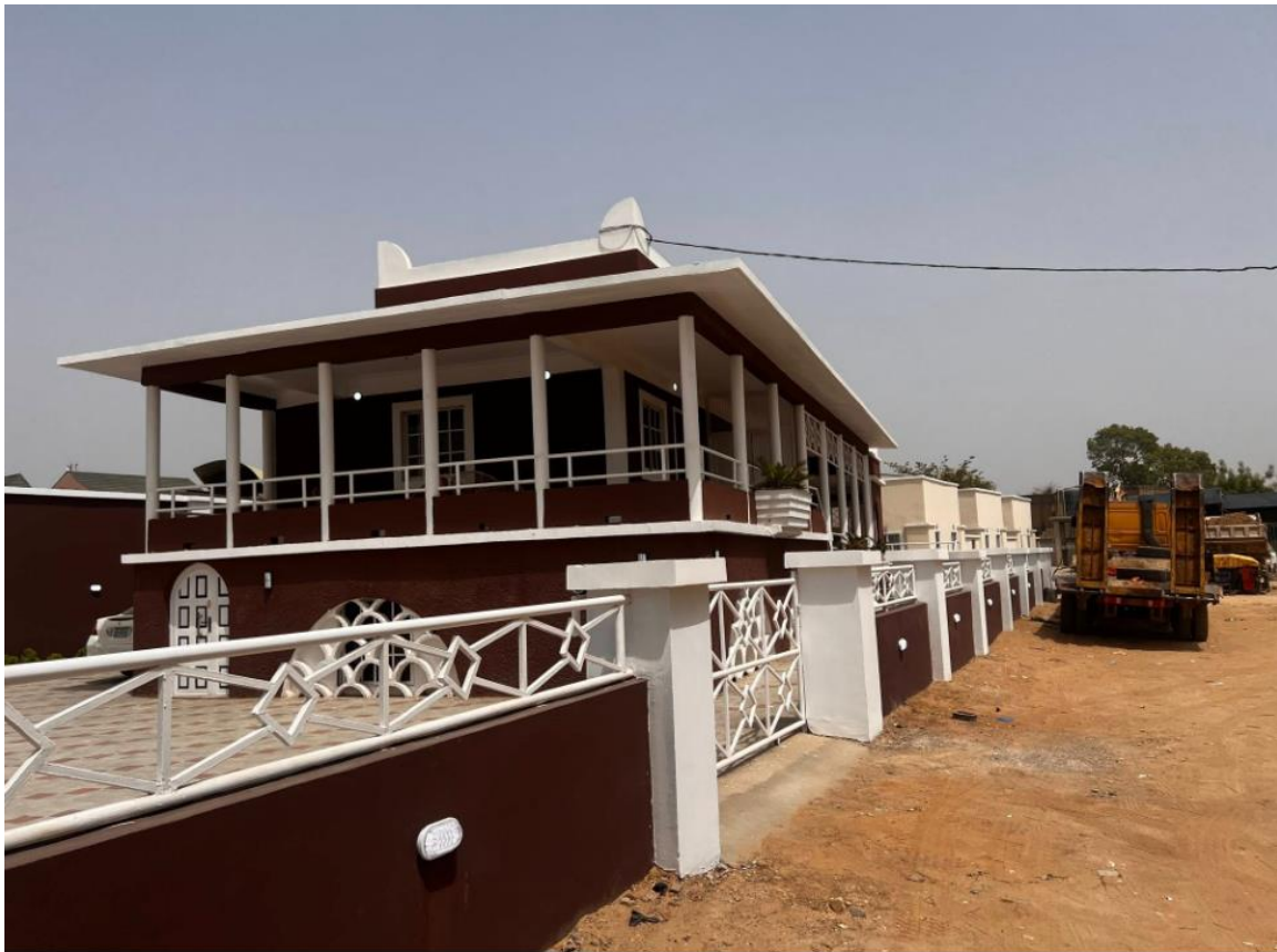
Figure 5: Gidan Palmer (Yusuf, 2025)