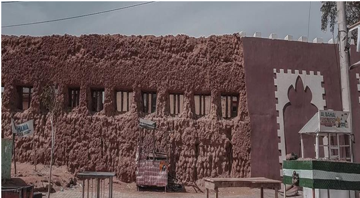
Figure 2: Ancient Kano City Walls in Gaen

Kano's city walls, built between the 10 th and 14 th centuries and stretching 14 kilometres, illustrate the city's historic fortifications. Their gates regulated commerce, security, and ceremonial events, cementing their urban and symbolic importance.