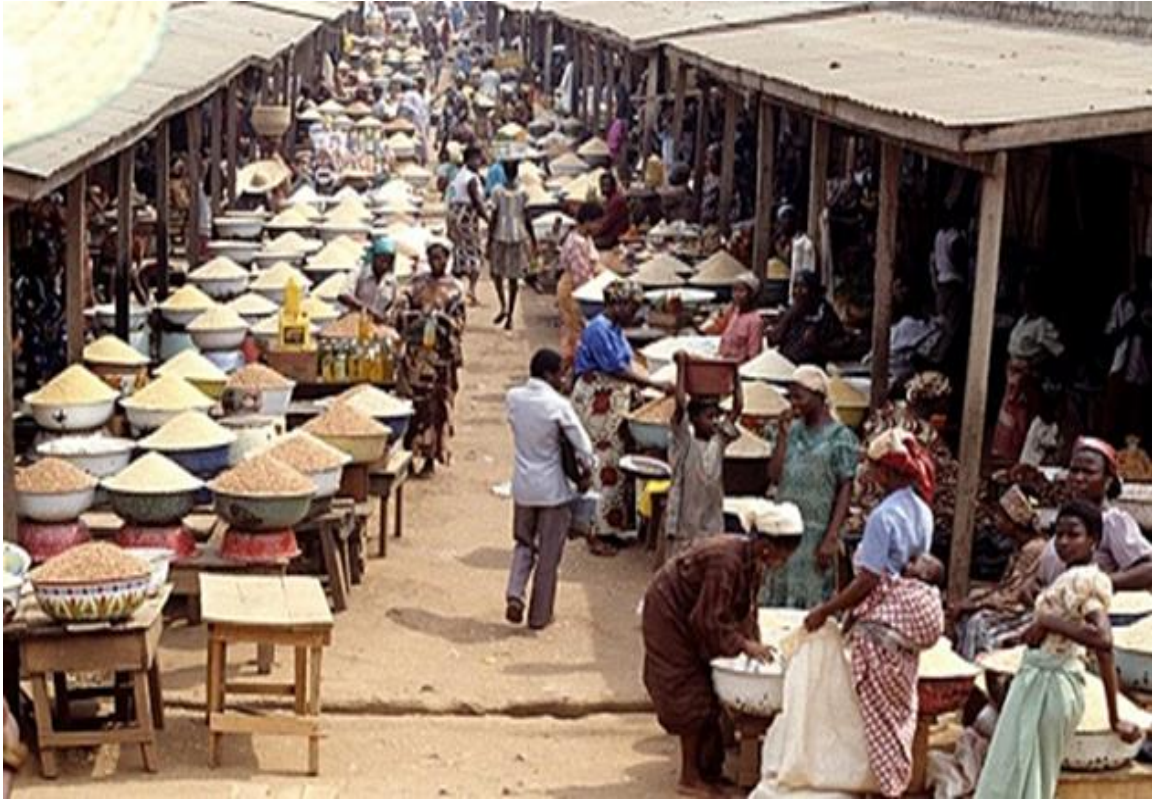
Figure 4: Kurmi Market